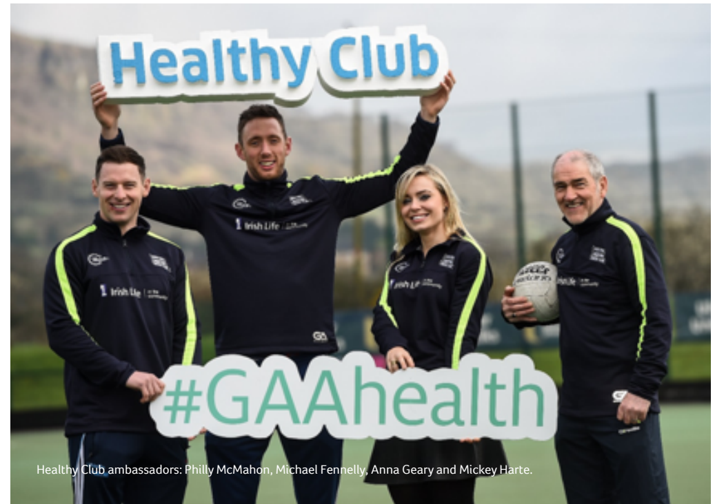
Healthy Club ambassadors: Philly McMahon, Michael Fennelly, Anna Geary and Mickey Harte.

Wellbeing Programme in the Department of Health says: "The enthusiasm of so many clubs seeking to get involved in the Healthy Club Project demonstrates the success to date and the willingness of clubs to play their part in promoting health and wellbeing. The GAA Club, as the hub in many communities across Ireland is well placed to support the Healthy Ireland agenda in delivering positive health messages at local level."